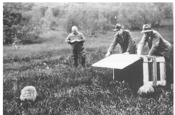
Figure 3. Release of beavers on the Songli property, 1926 or 1928.

Historical records and many place names indicate the species was common and widespread throughout Trøndelag in historic times, including the study area (e.g. Bjørbekken, 'beaver stream', Table 1). The original population is thought to have been exterminated by the early part of the 19 th century. The last animals in Sør-Trøndelag are said to have been trapped out by a