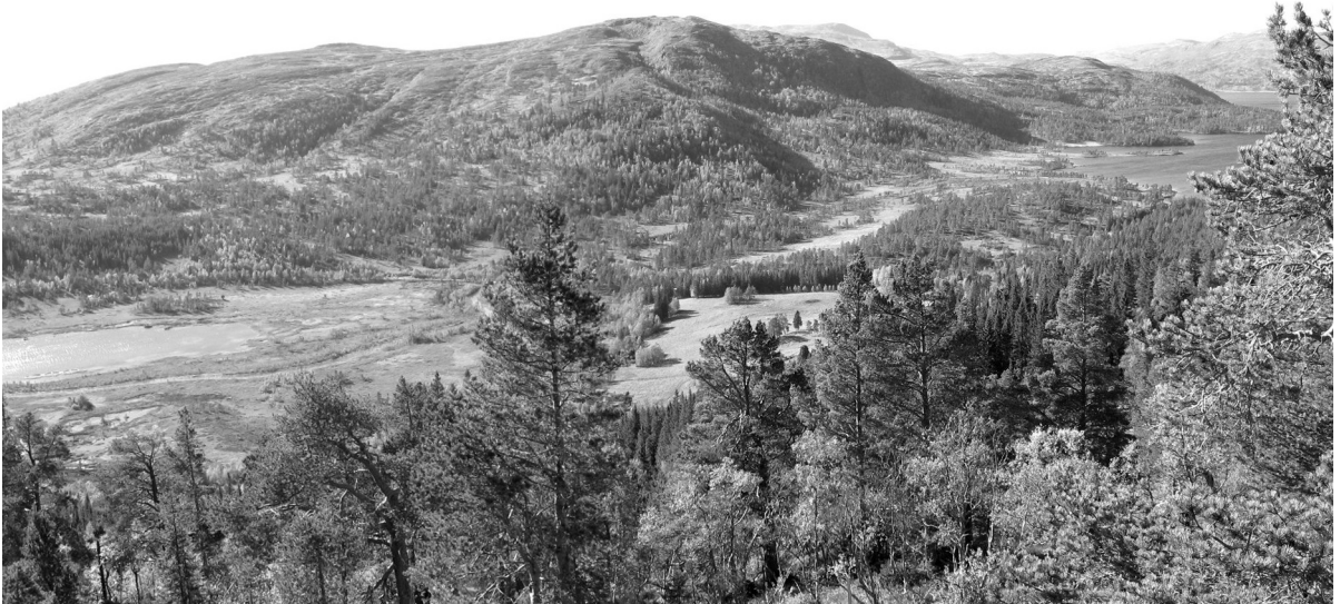
Figure 2. Part of the study area, showing typical landforms and vegetation. The river and bog at left are the site of beaver territory 10 (see Figure 4).

Records of beaver occupation, and collection of historical materials on the population, were made by the first author from 1995 onwards. Although beavers are game animals in many areas of Norway, they have been a protected species in the study area (and on the lower Orkla) throughout the period from reintroduction onwards.