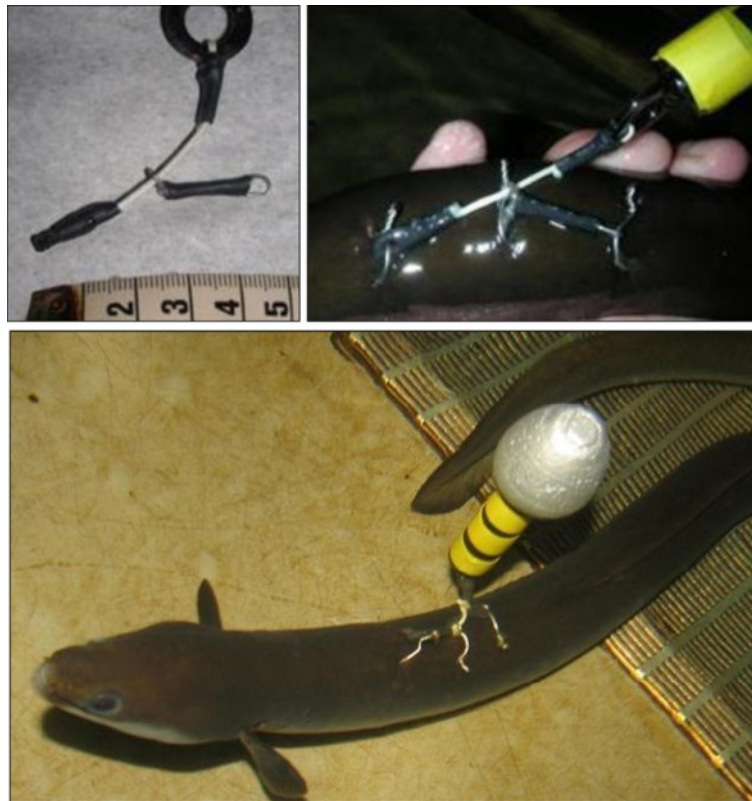
Figure 5 Photos of the Westerberg method used to attach pop-up satellite archival transmitters to European silver eel.

loop had a horizontal angle but was bent up 90°, and the other loop was vertical (Figure 5). The wire was covered with heat-shrink tubing. A flexible nylon leader was run from the tag through the upward facing loop. Three hollow needles were placed parallel, just under the skin on the back of the eels. Three separate 0.8-mm-diameter stainless steel wires were threaded through the needles and placed just under the skin. The wire closest to the head of the fish