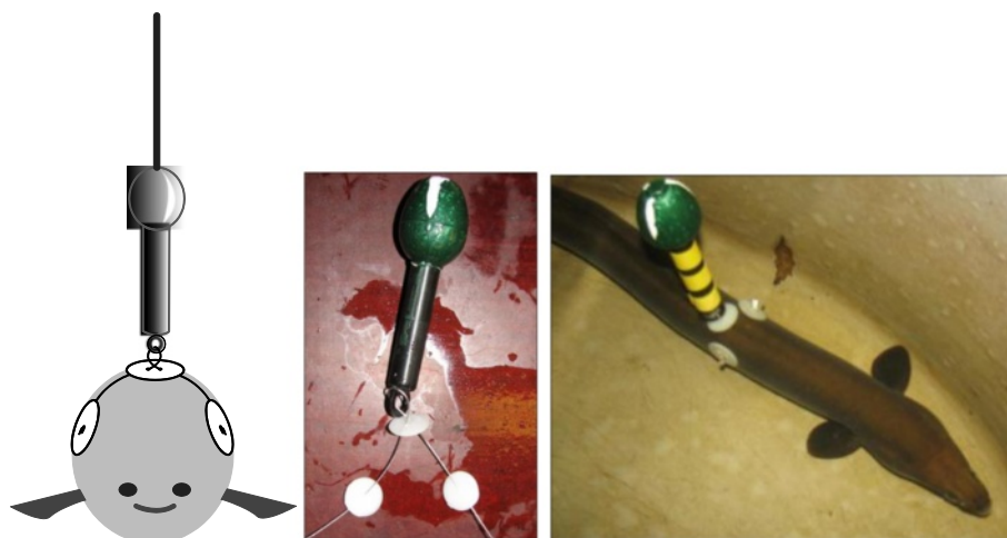
Figure 4 Illustration and photos of the Jellyman and Tsukamoto tagging method used to attach pop-up satellite archival transmitters to European silver eel. The method is slightly modified from the tagging method described by Jellyman and Tsukamoto [11-13].

A 25-mm-long wire with a loop in each end was made by twisting a 0.8-mm-diameter stainless steel wire. One