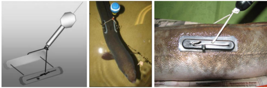
Figure 3 Illustration and pictures of the Økland tagging method used to attach pop-up satellite archival transmitters to European silver eel.