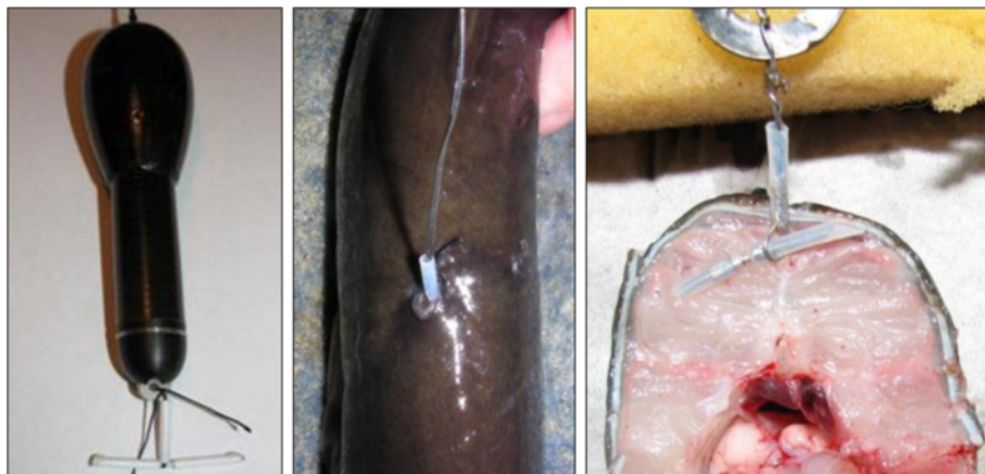
Figure 6 Photos of the Økland-Westerberg anchor implant method used to attach pop-up satellite archival transmitters to European silver eel.

This method was developed during this study and relies on a single attachment point using the strength of the