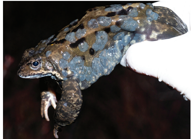
Figure 1. Ranid herpesvirus 3 infection in common frog Rana temporaria tadpoles, Norway. Image shows a large number of multifocal to coalescent, mildly elevated, gray patches (epidermal hyperplasia) extending over most of the integument, particularly clustering along the left flank. Between gray areas is normally pigmented skin.

Finding genomic RaHV3 DNA in free-ranging tadpoles is a major step toward understanding the