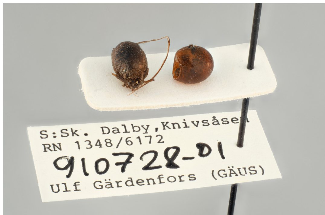
FIGURE 7. Mummie of Stomaphis quercus (Linnaeus, 1758) (left) and empty cocoon of Protaphidius wissmannii (Ratzeburg, 1848) from Skåne, Sweden.

Republic, England, France, Germany, Hungary, Italy, Latvia, Poland, Serbia, Slovakia, Spain, and Ukraine (Yu et al. 2016, Hodgson et al. 2019). The records of Protaphidius wissmannii of the East Palaearctic region most likely concern very similar species (Yamamoto et al. 2020). Figure 6 shows the records from the Nordic countries.