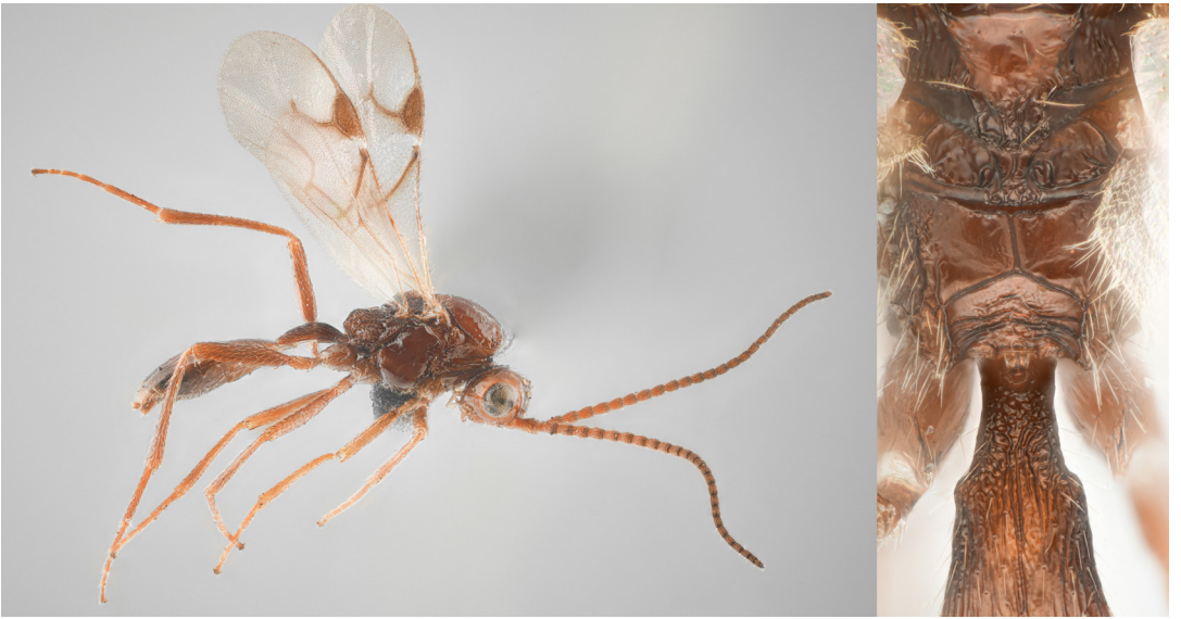
FIGURE 3. Protaphidius wissmannii (Ratzeburg), male, Sweden, Skåne county. Habitus, lateral aspect (left); Mesosoma (posterior part) and first metasomal tergite, dorsal aspect (right).