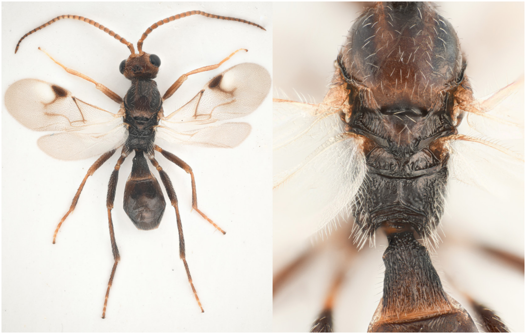
FIGURE 1. Male of Protaphidius wissmannii (Ratzeburg) from Norway, Søndeled, Risør in Agder. Habitus (left), Mesosoma (posterior part) and first metasomal tergite, dorsal aspect (right).