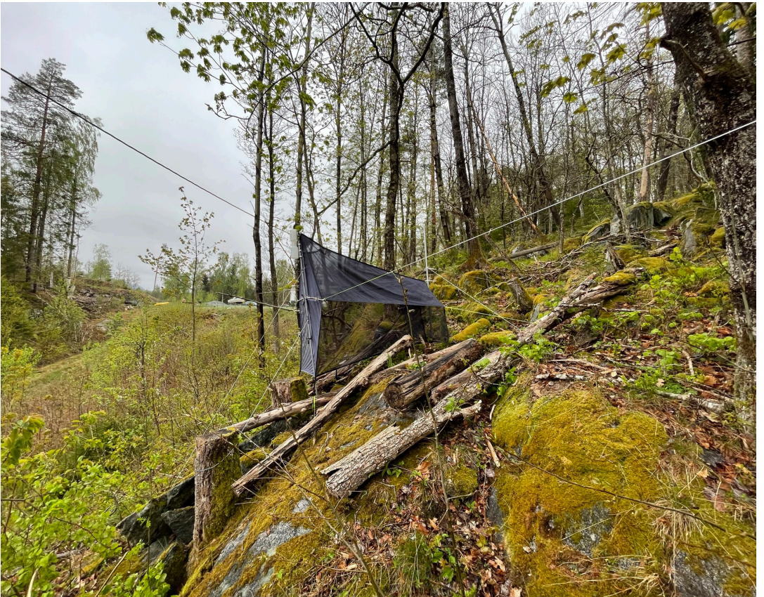
FIGURES 4. Location of the Malaise trap at Søndeled, Risør in Agder, 10 May 2022.