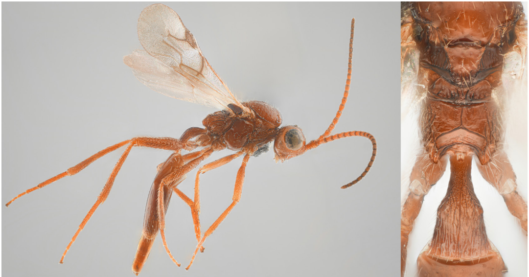
FIGURE 2. Protaphidius wissmannii (Ratzeburg), female, Sweden, Skåne county. Habitus with retracted metasomal segments, lateral aspect (left); Mesosoma (posterior part) and first metasomal tergite, dorsal aspect (right).

quercus , attended by Lasius fuliginosus in bark crevices on lower trunk of rather large trees of Betula pendula var. pendula Roth (= Betula