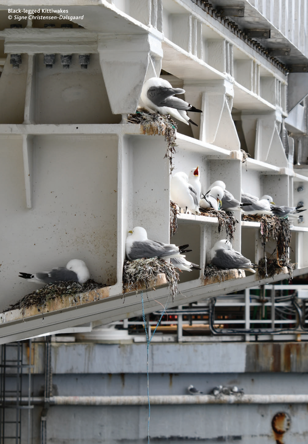
Black-legged Kittiwakes