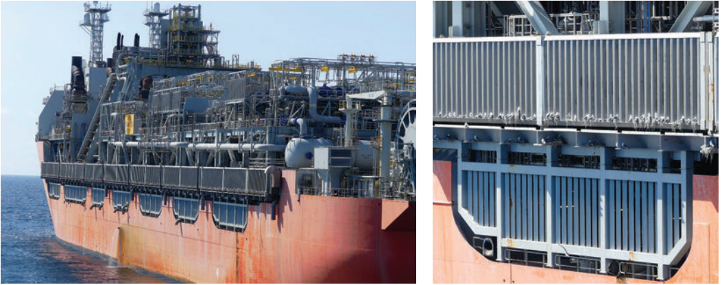
Figure 2. Examples of breeding localities on floating production storage and offloading unit, here on Skarv © Supply Vessels “Viking Lady” and “Chieftain Island”