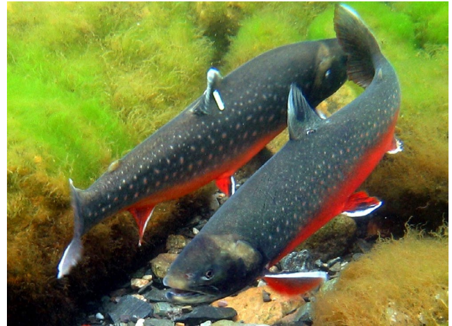
FIGURE 1 Two mature anadromous Arctic char from the Hals watershed, tagged with individual numbered Carlin tags attached just beneath the dorsal fin

In the present study, we tested consistency in migration timing to and from the sea among individuals of the River Halselva populations of anadromous Arctic char and brown trout. Furthermore, we studied ecological consequences of this repeatable individual variation in migration timing in terms of growth, survival, age at first maturity, and fecundity. The fish were individually tagged (Figure 1) and recorded when passing a trap in the river mouth. Following the