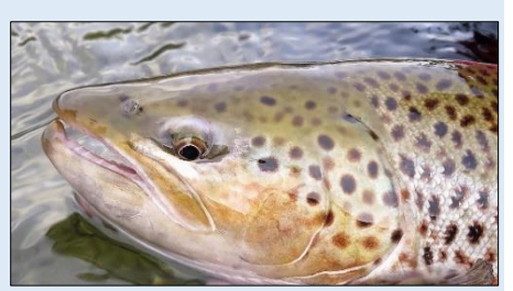
Sea trout.

Atlantic salmon perform long-distance feeding migrations in the Atlantic Ocean, before returning to the rivers to spawn after one or several years. On their way to ocean feeding areas, they spend up to a few weeks migrating through coastal waters, where fish farms are situated and lice levels may be high. In contrast, sea trout typically remain feeding in coastal waters (usually within 80 km of their home river, although some migrate further). Sea trout spend a variable amount of time at sea, from a few months during summer, to periods lasting a year or more. Some sea trout return to freshwater to spend the winter there, whereas some stay at sea.