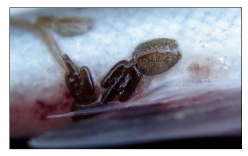
Figure 1. Salmon lice grazing on wild sea trout (upper and lower left) and a resulting cranial lesion (lower right) Salmon lice feed on the mucus, skin and underlying tissue including blood. The mobile preadult and adult stages of salmon lice (fig. 2) cause more severe tissue erosion than earlier stages. Tissue damage by the mobile stages ultimately causes mortality of the most heavily infested fish.

Salmon lice-infested fish have shown a reduced body mass and condition factor compared to control fish (see references in Finstad & Bjørn 2011, Finstad et al. 2011, Thorstad et al. 2015). This may be due to harmful stress responses, dehydration, and reduced feeding activity. Sublethal levels of salmon lice may also reduce the swimming performance of the fish (Wagner et al. 2003, 2004).