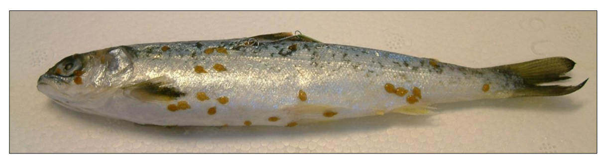
Hatchery-reared Atlantic salmon with preadult salmon lice.

The increased host density in areas with fish farming promotes transmission and population growth in salmon lice (Jansen et al. 2012, Torrissen et al. 2013). In coastal areas with intensive Atlantic salmon farming, the large disparity in abundance between cultured and wild hosts means that larval production of salmon lice must originate primarily from farmed salmon and not from wild fish (Tully & Whelan 1993, Heuch & Mo 2001, Butler 2002, Heuch et al. 2005, Penston & Davies 2009). This is verified in a new study showing that salmon lice on wild fish in farm-intensive areas have lice with the same resistance to chemicals used in farms (Fjørtoft et al. 2017).