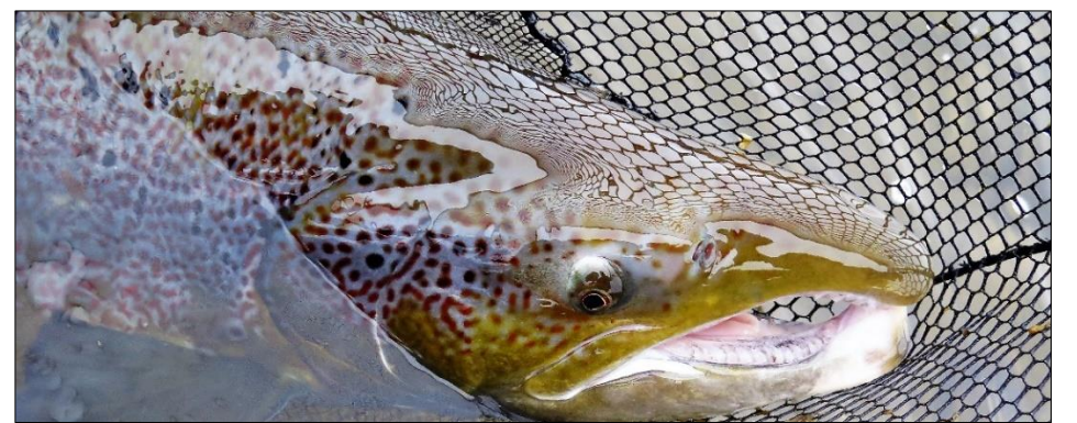
Wild Atlantic salmon male in spawning colours.

2014, Krkošek et al. 2014, Vollset et al. 2014). Within any given release group a risk ratio of 1.14-1.41:1 reflects that 12-29% fewer unprotected than protected fish ultimately are recaptured as adults, which is an indication of the effect of salmon lice at these localities at the time the fish were released. A meta-analysis including all the Norwegian studies showed an overall risk ratio of 1.18:1, but the effect varied strongly between groups (Vollset et al. 2016).