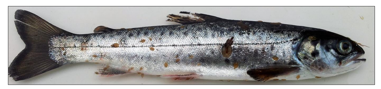
Figure 3. Wild sea trout with dorsal fin damaged from salmon lice