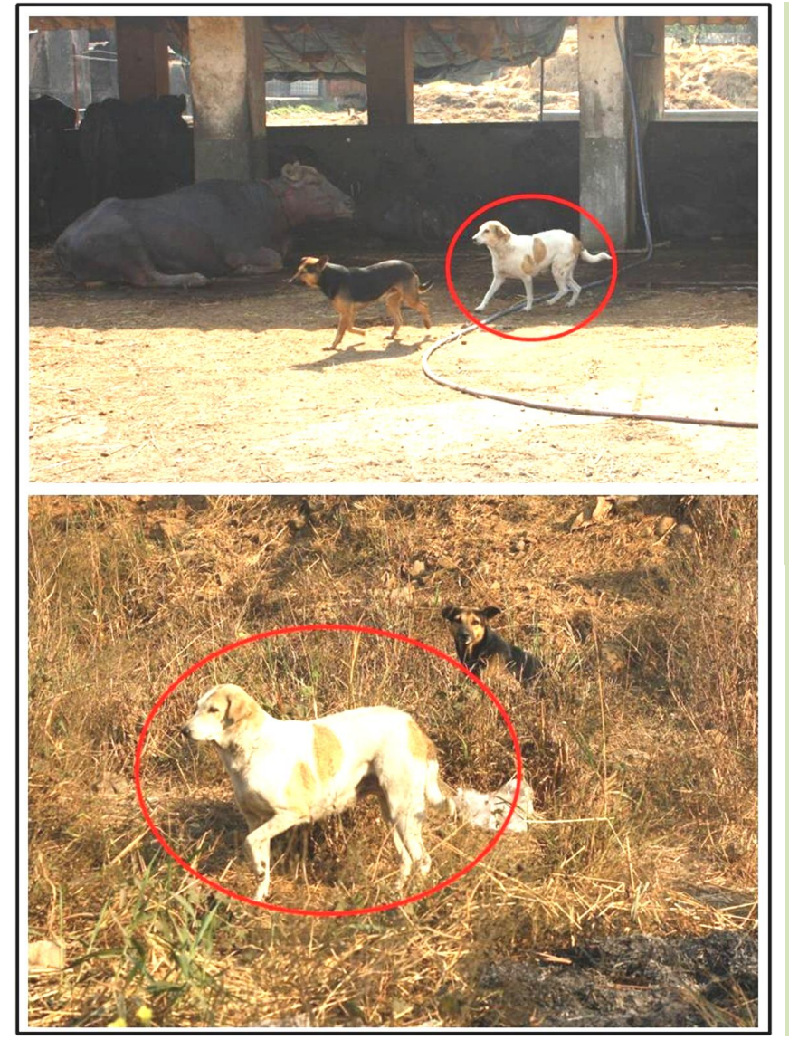
Fig. 2. The image indicates photographs obtained for a distinct naturally marked dog over two secondary sampling intervals in Aarey Milk Colony, India.

[34]. This is similar to Bowden's estimator in the NOREMARK program [24]. As marks were individually identifiable, we used individual heterogeneity models with the data, since we expected individual dogs to have differential sighting probabilities. We used the time-constant models, with or without individual heterogeneity parameters. Since some convergence issues occurred for values of \sigma (individual heterogeneity parameter) for the time-constant model with heterogeneity, we manually supplied initial values covering the probable range of parameters in the three models. We also used other options to overcome convergence issues for values of \sigma , such as the 'Alt.Opt.method' and 'Do not standardize design matrix' in another two models. In all we used seven time-constant models, the first six of which represented the time-constant model with individual heterogeneity, with various options as described above. The last model represented the time-constant model without the individual heterogeneity parameter (where \sigma was fixed to zero). Model comparison was performed in an information-theoretic framework using Akaike's information criteria corrected for small sample size (AICc).