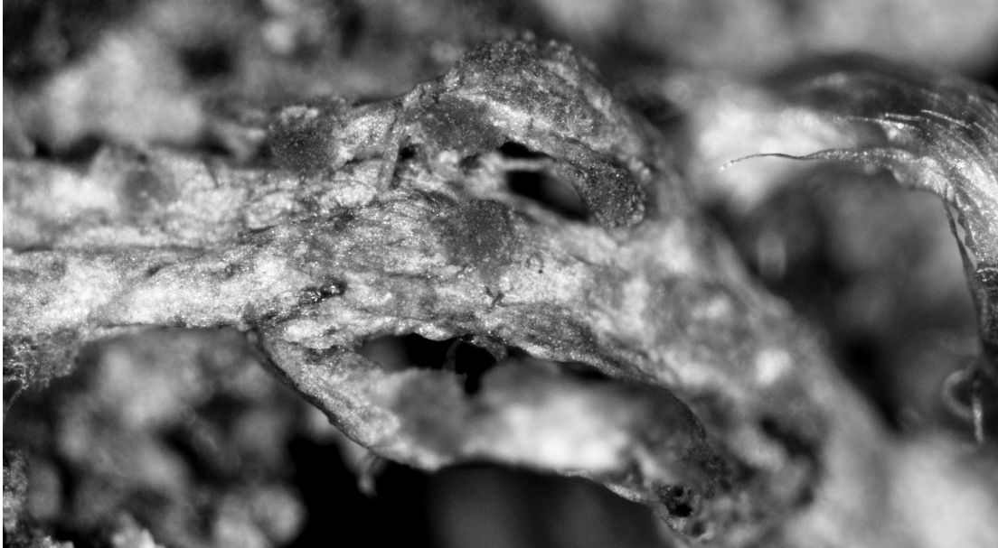
Figure 2. Vezdaea aestivalis from Voss, Sandbrekkene.