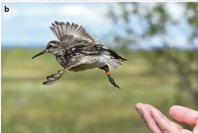
Fig. 3. (a) Capture of a Broad-billed Sandpiper with a mist net laid over an incubating bird at the nest. (b) Release of a Broad-billed Sandpiper after colour-ringing.