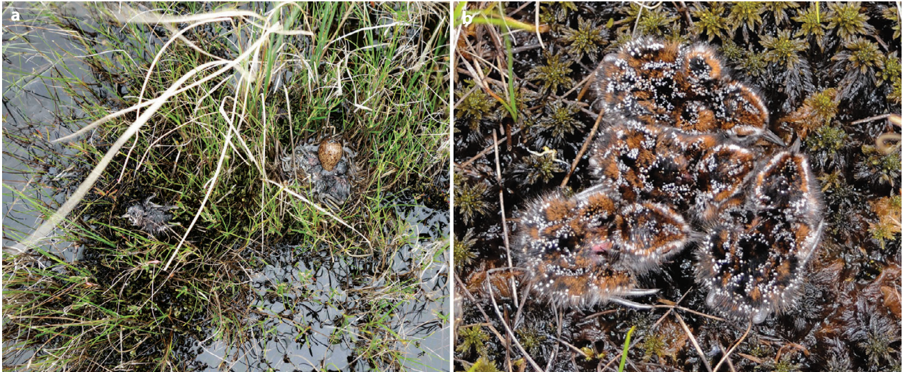
Fig. 5. (a) An unsuccessful nest of a Broad-billed Sandpiper that failed due to flooding, with three dead chicks and one unhatched egg. (b) A successful brood of newly hatched chicks of Broad-billed Sandpipers.