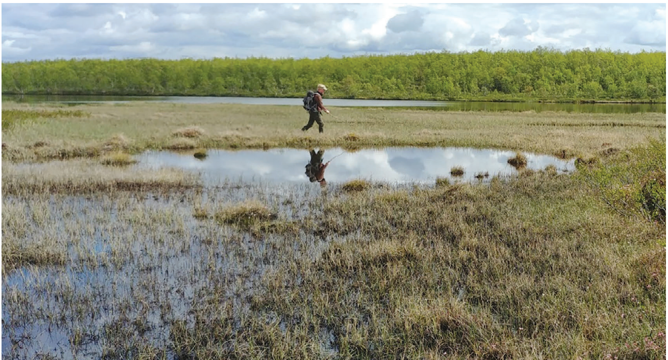
Fig. 1. Searching for Broad-billed Sandpipers nesting in wet quaking fen, Finnmark, Norway. The main breeding habitat is in the foreground, wet quaking mesotrophic fen. The dominant plants are sedges Carex spp. and Cottongrass Eriophorum angustifolium above a floating mat of dark brown bryophytes, mostly Sphagnum lindbergi (Rae et al. 1998). There was often open water in the centre of these stands, and heath and woodland cover the surrounding drier peaty ridges. The dominant heath species are Lingonberry Vaccinium vitis-idaea and Cloudberry Rubus chamaemorus . The main trees are Downy Birch Betula pubescens , Dwarf Birch B. nana , and willows Salix spp..

Broad-billed Sandpipers are the last of the breeding waders to arrive on their Finnmark breeding grounds at the end of May and the beginning of June (Svensson 1987,