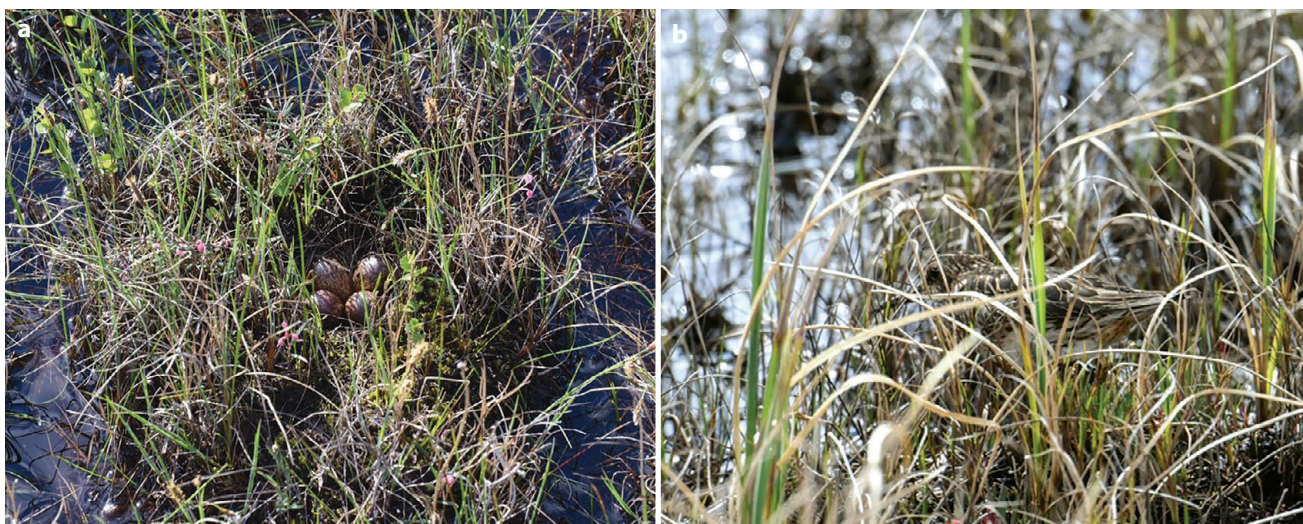
Fig. 2. (a) A Broad-billed Sandpiper nest set on a mossy hummock in a wet mire. The pink flowers are Bog Rosemary Andromeda polifolia , and the bright green leaves are Dwarf Birch Betula nana . (b) A Broad-billed Sandpiper sneaking off its nest upon the approach of an observer.

Ratcliffe 2005). North-bound migrating birds leave the Sivash marshes in the Black Sea from the 24 May onwards (Verkuil et al. 2006). Spring migration has been recorded through Ottenby, southern Sweden and coastal sites in Estonia during 17 May–7 June (Waldenström & Lindström 2001, Pehlak 2008). By the time Broad-billed Sandpipers arrived at our study area, most of the other species of waders were already incubating eggs, including Ruff Philomachus pugnax , Spotted Redshank and Wood Sandpiper Tringa glareola (Ratcliffe 2005). The main nesting period for Broad-billed Sandpipers was June and chicks hatched from late June onwards (R. Rae pers. obs.).