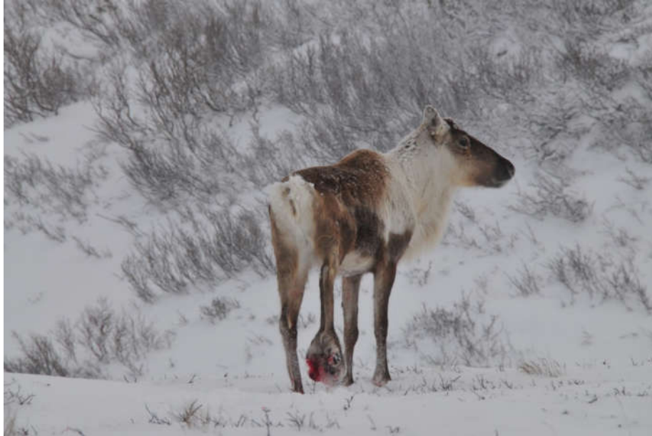
Figure 1. An adult male wild Eurasian tundra reindeer (Norway, January 2015) with digital necrobacillosis ( slubbo in North Sámi). The distal part of the right hind leg was extremely swollen and was bleeding. The condition was very painful, and the animal only reluctantly used the hindleg. The bull was shot for animal welfare reasons, and pathological findings (Norwegian Veterinary Institute) confirmed the diagnosis.

However, digital necrobacillosis (which, in some early descriptions, is often referred to as “reindeer foot disease”/“reindeer foot rot”) has long been a well-known and feared disease in semi-domesticated reindeer, especially in the 18th and 19th centuries [40–42]. Large disease outbreaks of digital necrobacillosis were often associated with the crowding of animals on wet and muddy ground contaminated with feces. Historically, the gathering of reindeer for milking was a practice that promoted digital necrobacillosis [43]. While the digital form of necrobacillosis practically vanished from the semi-domesticated reindeer in Fennoscandia after the termination of milking, as well as after the switch to larger herds and to extensive herding, the oral form of the disease has been increasingly appearing, associated with new practices of supplementary feeding [34,44].