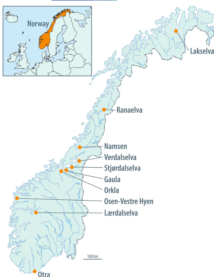
FIGURE 1 Map of Norway showing the location of the eight rivers where salmon were tagged during catch and release angling. In addition, the location of the River Namsen is shown, from which an additional data set was obtained

exploitation rates (the proportion of the salmon in the river being captured during the angling season, including caught and released salmon) were collected from the Norwegian Scientific Advisory Committee for Atlantic Salmon (published at www.vitenskaps radet.no). The estimates were done as described by Forseth et al. (2013), using a model developed from 214 local estimates describing the exploitation rates for different fish sizes and differently sized rivers, in addition to using local, annual fish counts, which existed for most rivers included in this study, together with catch statistics. The annual estimates of exploitation rates for each river were adjusted according to information on fishing pressure (e.g., number of anglers, organisation of the fishery, quotas, length of the season, permitted gear) and fishing conditions (favourable/unfavourable discharge or temperature). There was no estimate of the exploitation rate from the committee for the River Ranaelva in 2014, so the 2013 estimate was used for 2014. A maximum model including all relevant explanatory variables as fixed effects was simplified by stepwise reduction based on the Akaike information criteria (AIC). A change in AIC of more than two was considered as enough support for keeping a variable in the model. The models