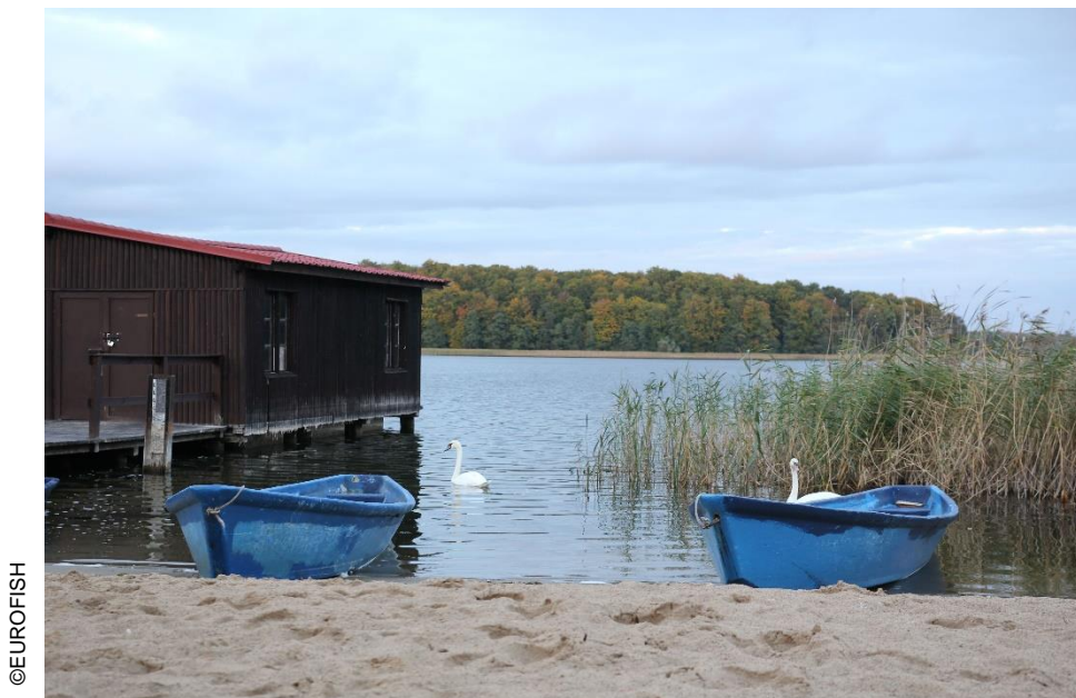
Inland waters are of significant environmental importance