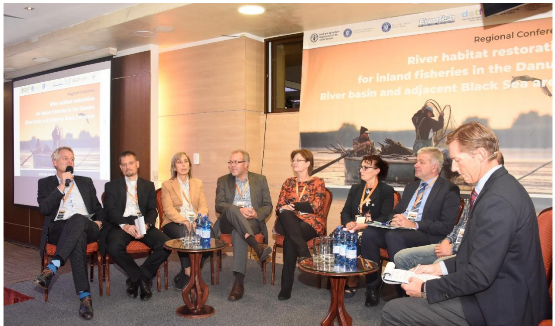
Each conference session was followed by a round of questions and answers