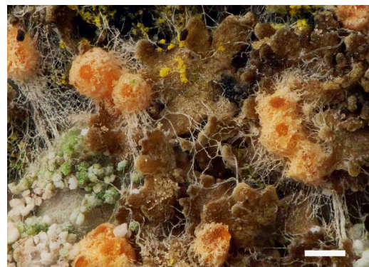
Figure 3. Paranectria oropensis ascomata and mycelium overgrowing epiphytic lichens (scale bar = 300 µm). Photo: Cristopher Reisborg, 2012.

Most of the species of sordariomycetes reported for the first time in Norway in this paper, and by Nordén et al. (2015), were probably present in Norway for a long time, but has been neglected by mycologists. However, it is also possible that some may be new arrivals resulting from a warming climate. H. subticinense may be the most likely candidate since Hypoxylon is among the best known genera of sordariomycetes in Norway and since it occurred at a climatically favoured site. Similar establishments would be interesting to follow in the future and more surveys should be performed in the southern parts of Norway.