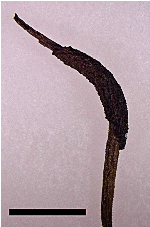
Figure 2. Ophiocordyceps stylophora stroma showing sterile upper part and papillate ostioles. The stroma was rooted in a click beetle larva concealed in a very much decomposed stump of Alnus glutinosa (scale bar = 5 mm).