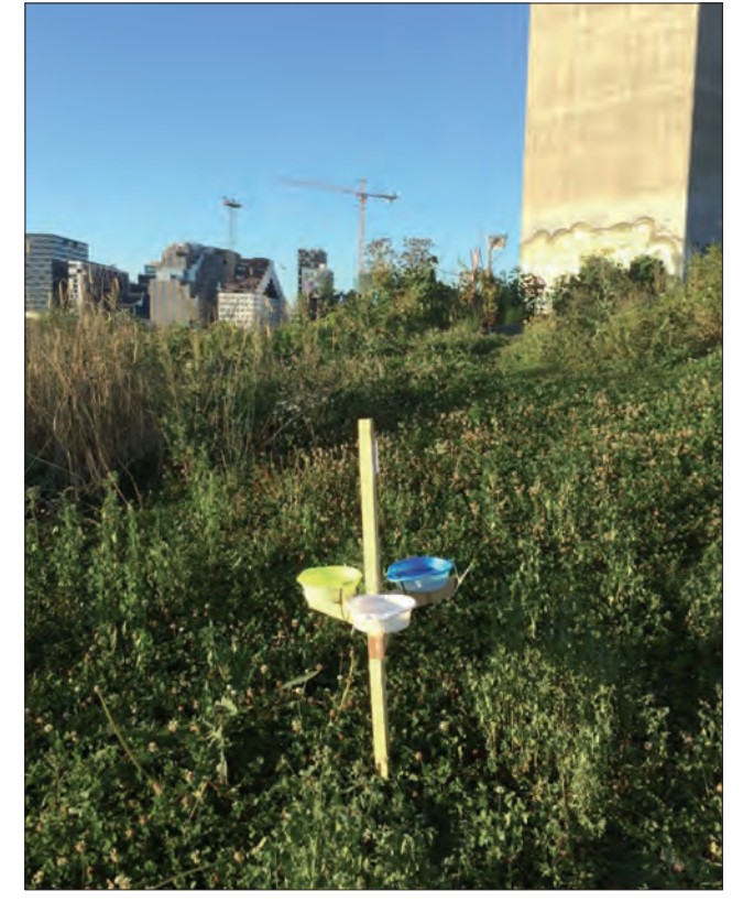
Figure 5 Pan traps used for sampling insects, here located in a small patch of native vegetation near Oslo's harbor.

insects using pan traps (Figure 5). Trap samples provided estimates of the overall abundance and species diversity of the three types of bees (honeybees, bumblebees and solitary bees), along with other insect pollinators (beetles, flies, moths/butterflies and other insects) attracted to the traps. Honey-production figures, supplied by ByBi-affiliated beekeepers, also provided a complementary method for assessing the quality and quantity of floral resources available to Oslo's honeybees. Unfortunately, these two complementary approaches provided neither a clear confirmation nor a negation of the ESTIMAP map output. Population abundance and community diversity did not vary significantly according to the mean ESTIMAP scores of areas that surrounded trap locations as defined by potentially relevant foraging distances (500 m, 1 000 m or 1 500 m radii). Honey production also did not vary according the mean ESTIMAP scores of areas surrounding beehive locations.