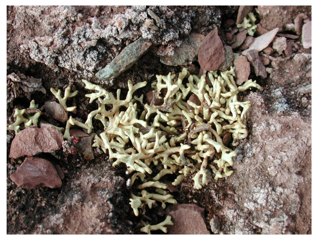
Figure 3. Allocetraria madreporiformis. The specimen Elvebakk 01:145 photographed in the field.

The very strong concentration of Allocetraria species to the Sino-Himalayan area and its estimated age of 7.5 Ma (Divakar et al. 2017) indicate that it also represented an evolutionary response to the formation of these large new habitats. Most species are adapted to terricolous, high-alpine habitats, up to altitudes of 5800 m; one species is primarily saxicolous, while another species grows on Rhododendron twigs near the treeline (Randlane et al. 2001, Wang et al. 2015b). On the other hand, A. madreporiformis appears to be primarily associated with steppe-like environments in this area, with secondary migrations to other dry and cold parts of the Northern Hemisphere. It is known from dry areas of China, such as Xinjiang, Qinghai and Tibet, and from Turkestan, Kyrgyzstan and Mongolia. In Europe it is even known from the alpine region of Sicily (Randlane et al. 2001). In North America, it is widely distributed in dry alpine and arctic areas, extending southwards to New Mexico (Thomson & Bird 1978, Brodo et al. 2001).