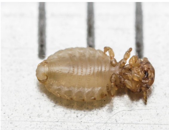
Fig. 4. Specimen of Trichodectes pinguis pinguis recovered from a brown bear ( Ursus arctos ) killed because of human-wildlife conflict in south-central Sweden in May 2015. The distance between the measuring bars is 1 mm.

Giebel in 1874. Despite this early description, there are very few published reports of the parasite in the literature. The next description of the louse was published by Burmeister in 1838 using Nitzsch's material. In 1948, Werneck described the female form of the parasite using samples from the British Museum that were