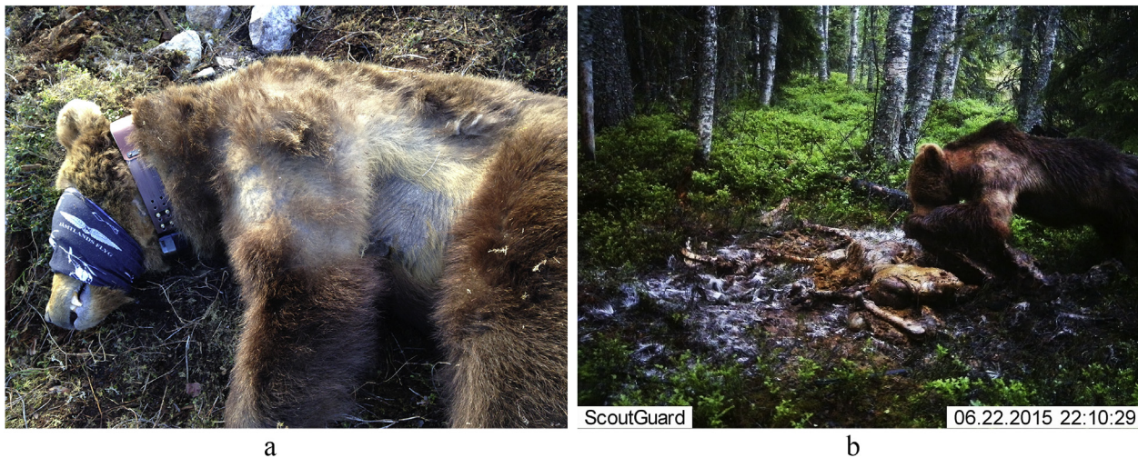
Fig. 2. A 15-year-old male brown bear ( Ursus arctos ), ID No. W1211, parasitized by Trichodectes pinguis pinguis . Notice the areas with partial or complete hair loss, hyperpigmentation and lichenification of the skin. a) April 2015 at the time of capture. b) June 2015 when feeding on a carcass.