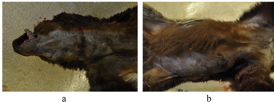
Fig. 3. Brown bear ( Ursus arctos ) killed because of human-wildlife conflict in south-central Sweden in May 2015. The bear showed extensive alopecia in the area covering a) the chin, ventral part of the neck; b) axillar region, and abdomen.