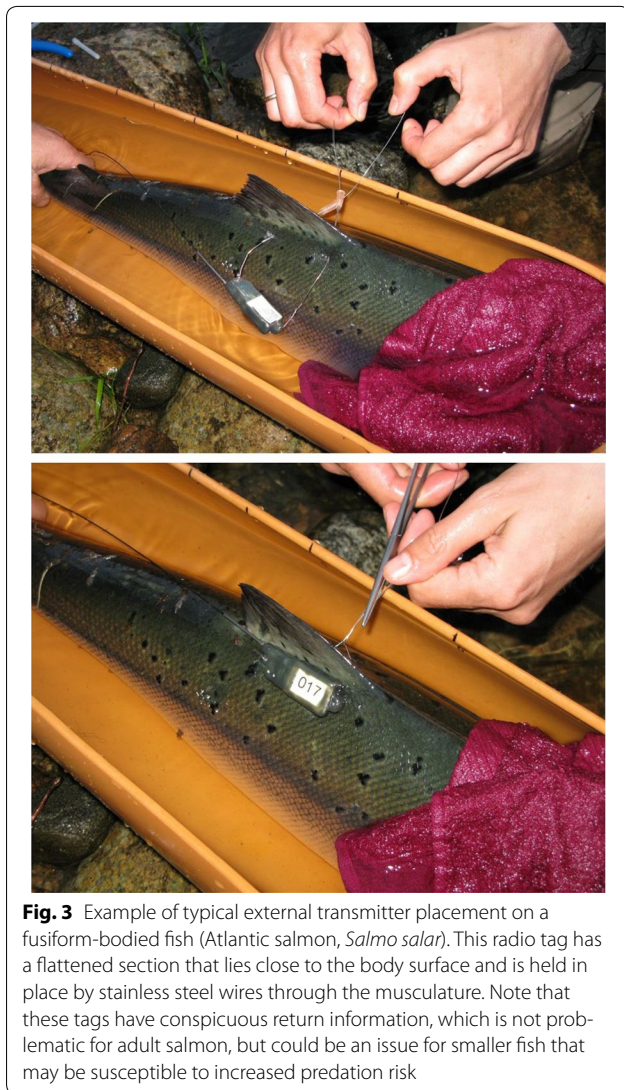
Fig. 3 Example of typical external transmitter placement on a fusiform-bodied fish (Atlantic salmon, Salmo salar ). This radio tag has a flattened section that lies close to the body surface and is held in place by stainless steel wires through the musculature. Note that these tags have conspicuous return information, which is not problematic for adult salmon, but could be an issue for smaller fish that may be susceptible to increased predation risk

tag retention. Tags must be attached snugly to the body to minimize the risk of entanglement/snagging, biofouling and to minimize drag. Several studies have reported problems with external tagging of sturgeon and catfish species. Collins et al. [29] used external radio tagging on shortnose ( Acipenser brevirostrum ) and Atlantic ( A. oxyrinchus ) sturgeons in a field study and found poor retention for both species. In a subsequent tank experiment, only one of 12 individuals retained the tag after 40 days [30]. They judged external tagging unsuitable for these species. However, Sutton et al. [31] tested different attachment methods on juvenile lake sturgeon ( A. fulvescens ) kept in tanks and reported that heavier suture material decreased transmitter loss, but the retention was still poor (75 % loss after 26 days). A subsequent test of different shapes of external tags resulted in loss of over